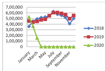
Figure 3. Number of foreign tourist visits to Indonesia in 2018 – 2020

Impact of Covid19 on Tourism in Bali can be understood as a collection of multidimensional and multidisciplinary activities related to tourism that emerges as a form of individual and national needs and of interactions. between tourists and local residents, other tourists, local authorities and business people. With the Covid-19 pandemic, all activities in various sectors have been halted to prevent further spread of the tourism sector Covid-19 is no exception. In accordance with data from the Central Bureau of Statistics of Bali Province. Below we can see the arrival of foreign tourists to Bali.