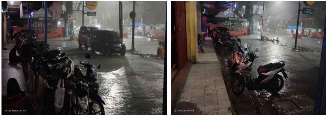
banjir dijalan Kapten Sudibyo