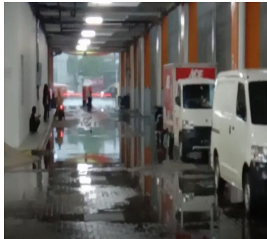
Sumber : Dokumentasi pribadi banjir dilorong jalan Mayjend Sutoyo