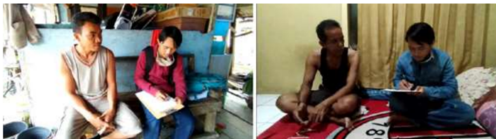
Figure 3. Survey and interview to respondents in Kangkung fishing village [36]

All respondents (100%) said that Lampung doesn't have Early Warning System of earthquake and tsunami. Most of respondents (77.4%) don't have enough information of the hazard of disaster. There were few respondents (7.5%) that have intention to join the disaster preparedness team called "Tagana" (Tagana is "Taruna Siaga Bencana" in Indonesia language that means young people that is resilient to disaster events), most of them refuse to join in (79.2%).