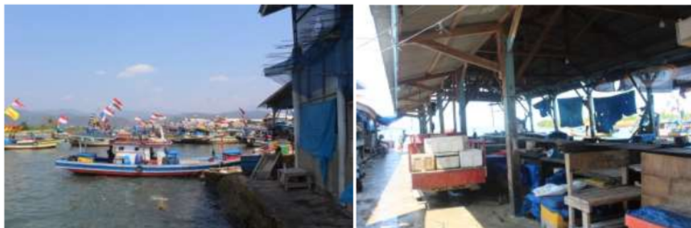
Figure 2. Fish market and the boats in Kangkung fishing village

It was reported that there were 58% of respondents are above 40 years old and 75% of them have low level of education of elementary school (75.5%) and there were only 7.5% that had high school education and no one (0%) went to the university. Most people in Kangkung fishing village are fishermen (79.2%, male) and there were 13.2% of respondents are house wife (female) and only 7.5% are entrepreneurs. There were only 32.1% of respondents that noticed they live in earthquake and tsunami prone area, but they remain live there because they already have job there (60.4%), feel comfortable (28.3%), and others don't have money to move to safer place (11.3%).