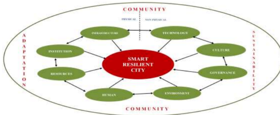
Figure 4. "Smart Resilient City" Model

"Smart Resilient City" Model (Figure 4) has 8 (eight) supporting aspects which come from the community. Those eight aspects divided into 2 parts, physical aspects and non-physical aspects. The physical aspects consist of human, resources, institution, and infrastructure, while the non-physical aspects consist of environment, governance, culture, and technology. All aspects will promote adaptation and bring them to sustainability. In this model, alert system and response of community are parts of infrastructure and technology, as well as human, resources, and environment, which give strong impact to adapt and achieve resilience. Therefore, "Smart Resilient City" model may become a great solution in Community Based Disaster Risk Reduction to cope with the hazard of earthquake and tsunami comprehensively and sustainably. Since many life have taken by tsunami strikes, alert and response system are very important as important part of Disaster Risk Reduction, especially in area with high population density.