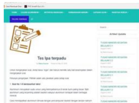
Picture 2. Test evaluation based digital module

the contents of the module's chapter, a scientific case will be provided, which has several specific instructions. The case questions will then be given some clues that are included in the realm of chemistry, physics, and biology. After that to make them more independent, students are asked to do independent assignments. The last they will be asked to do quizz questions (evaluation tests) in the module as their cognitive learning outcome